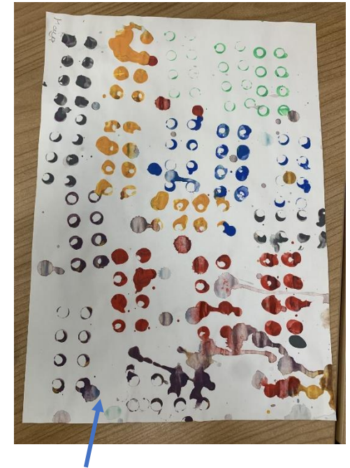
Use of Lego to print colours.