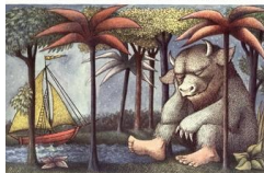
STORY AND PICTURES BY MAURICE SENDAK